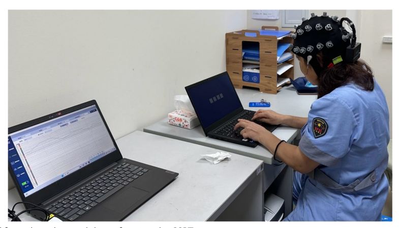
Fig. 3 EEG will be recorded from the subject while performing the SSRT

computer program will record the response time and the interstimulus interval for each trial [33].