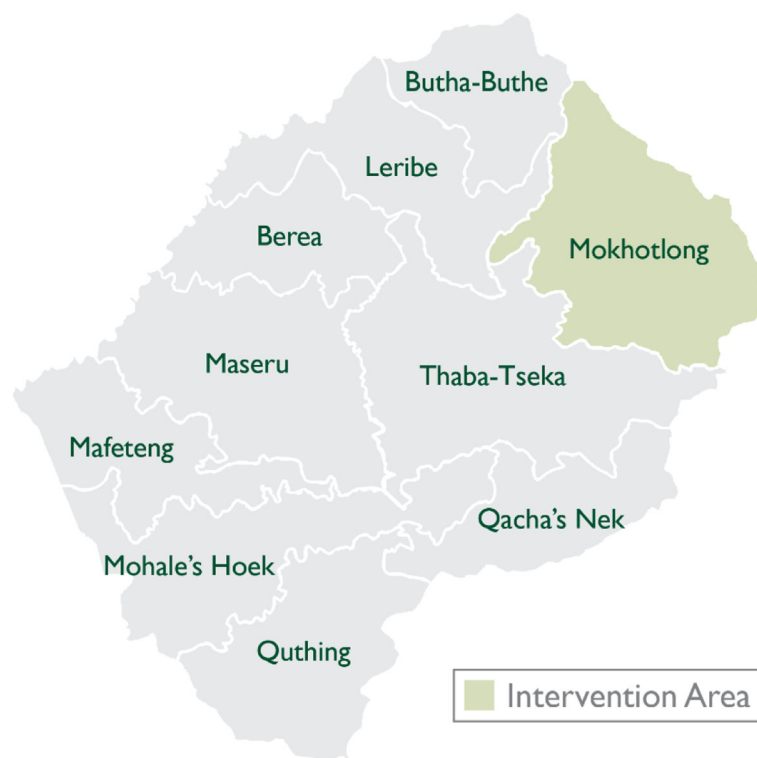
Fig. 1 Location of Mokhotlong district, Lesotho

and (3) “Growth” (nutrition education) in addition to a Community Health Outreach Day at the end of the intervention period.