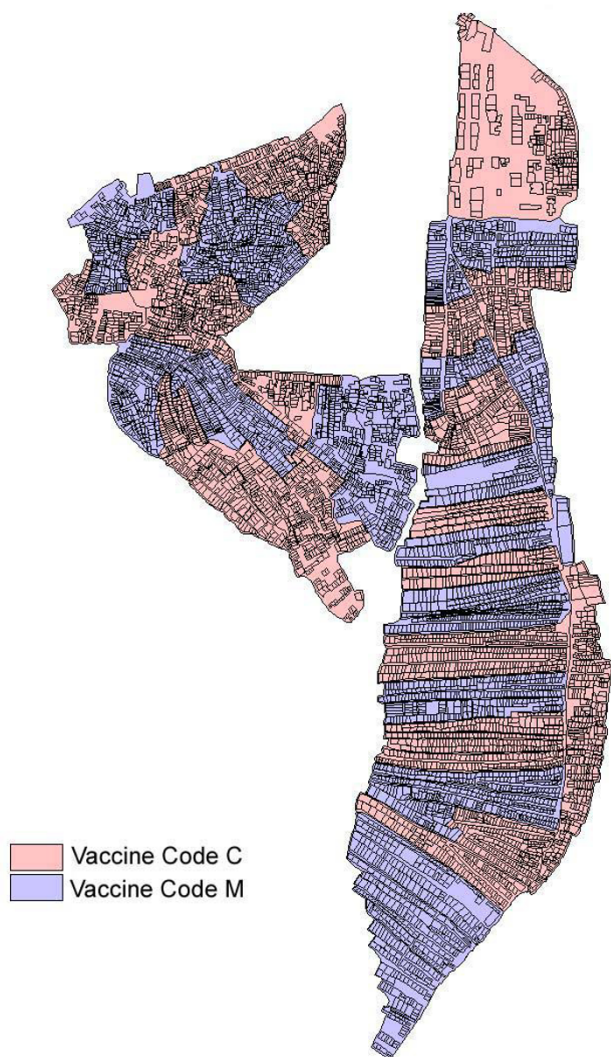
Figure 2 Cluster wise distribution of vaccine codes in Vi demonstration project Karachi – Pakistan 2003.

ings were conducted at intervals throughout the campaign.